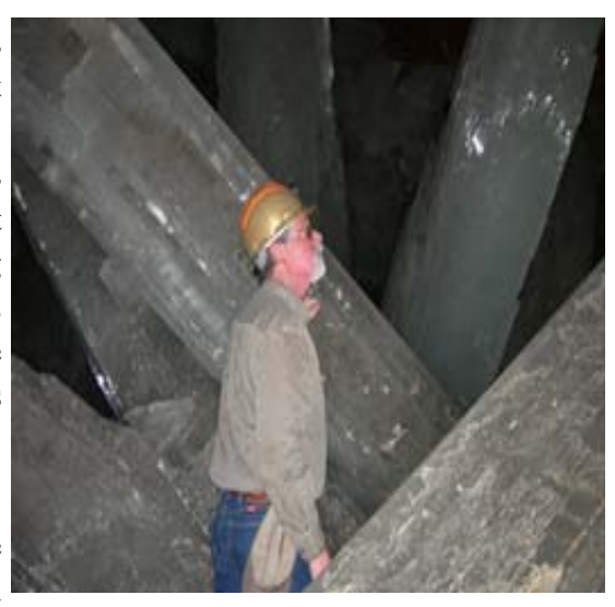
Cueva de los Cristales (Naica Mine)

Learning about local history will be a fascinating part of the trip. The trip will cover history from millions of years ago (for the growth of the crystals at Naica), to the pre-Columbian time when Paquimé was occupied, to the Mexican Revolution in 1910.