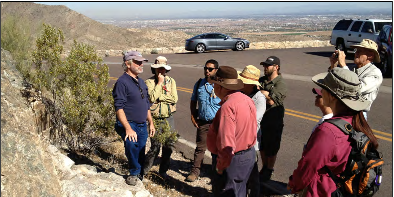
The group examines the contact between the mid-Tertiary Telegraph Pass Granite and the Proterozoic Estrella Gneiss in the South Mountains.