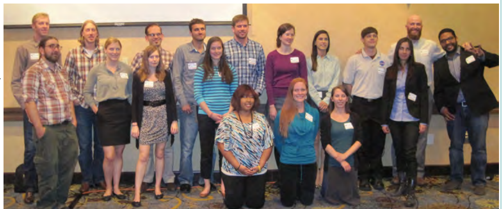
The student presenters at the 2013 Doug Shakel Student Poster Session